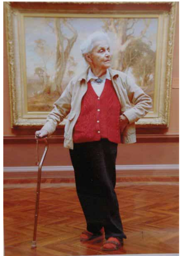
Nora Heysen at 92 The Art Gallery of South Australia, May 2003 The photograph says it all ..don't you think?

Accrued finances need to be directed towards a continued programme of restoration and framing of the work particularly in view of ongoing Exhibition hanging in