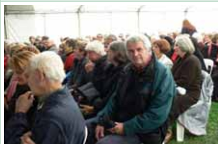
Guests 'under the marquee' and keeping dry at the launch of 'a life of her own'

Footnote – The rumour heard circulating on the day that the Foundation Chairman had been seen earlier in the morning standing, totally drenched in the pouring rain in what can only be described as a highly agitated state of behaviour, shaking both fists at the darkened heavens – is in fact quite true. However we are pleased to report that by the conclusion of the afternoon's proceedings he had fully recovered and was indeed seen devouring copious amounts of coffee, cake and conversation at the afternoon tea following the screening.